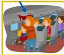
overhead bin (overhead compartment)